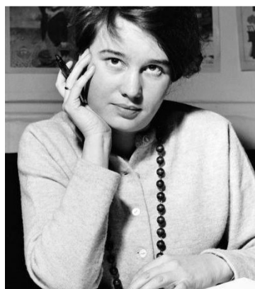
Ulrike Meinhof: The German Rebel

One of the most controversial rebels that the world has seen, Ulrike Meinhof, would've turned 82 on 7 Oct, had she been alive. A staunch leftist journalist of her times, Meinhof was also the co-founder of the German militant organization Red Army Faction (RAF). Accused of 47 murders and robberies through RAF in Germany, she breathed her last in prison. But how she died was what came to the rescue to justify her actions - murdered by the officials, but claimed to have attempted suicide. The reason stood tall and erect - an attempt on the part of the government to